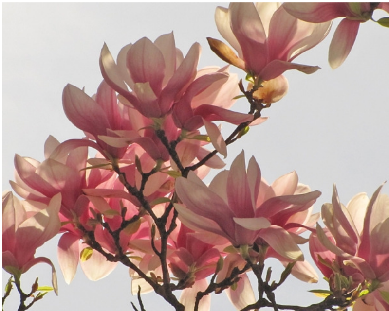
in Woodhaven