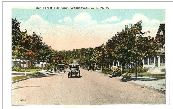
Postcard of Forest Parkway, 1918